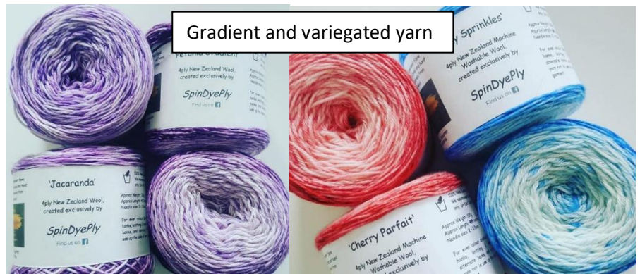
Gradient and variegated yarn